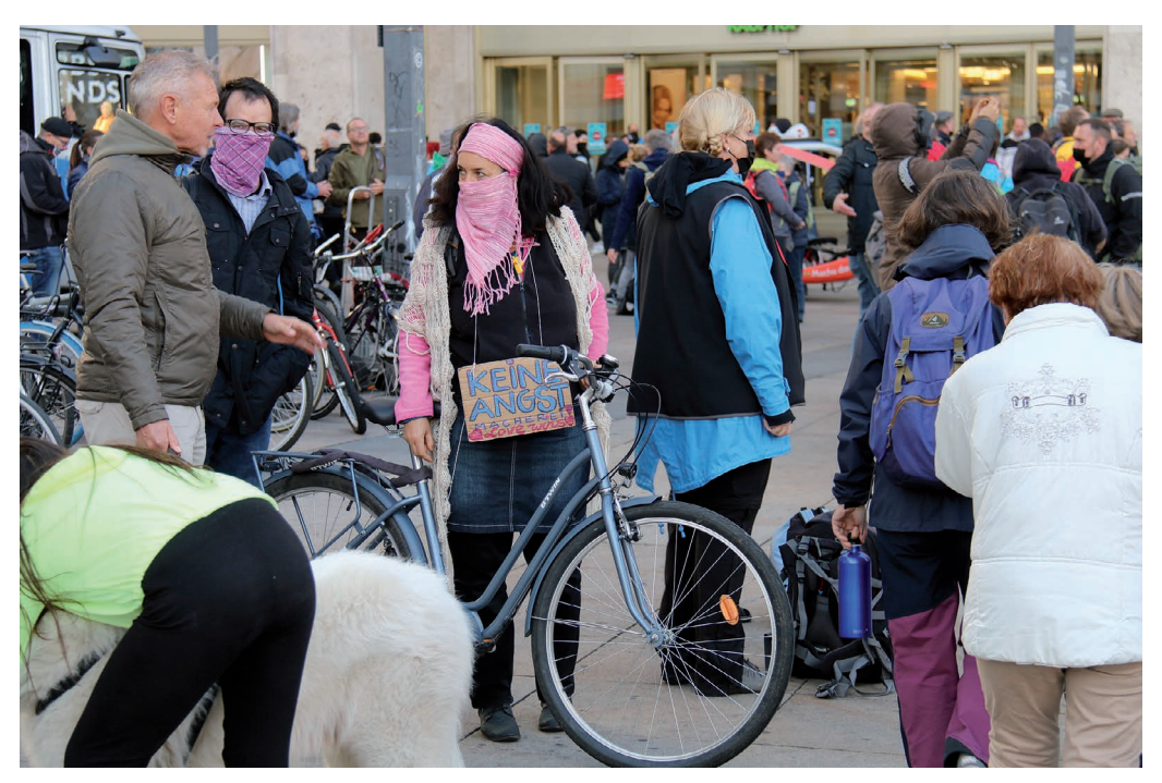
Fig. 18 Love and fear. Berlin. October 10, 2020.

Corona is not necessarily worse than the others. Viruses are always among us, and she knows people who have had very severe courses of herpes and Epstein-Barr and long-term consequences such as chronic fatigue syndrome, as is now also reported from Corona. That's just the way it is, it can happen and it's really bad, but you don't make such a circus out of it as with Corona. It would be better to make sure that people eat better and don't get so fat, and then they wouldn't be so vulnerable. But she would not go to such a demonstration, because she would be afraid of being seen. The Berliner Morgenpost newspaper always said that the protesters against the Corona policy were extreme right-wing people. She was employed and if her boss found out that she was at such a demo, she would not be employed for long anymore. And she had been self-employed for a long time and knew what existential fear means. If she is seen here now, she can always say that she lives here. She continues that the press has become a real problem, that it is all hard to believe, but the media have so much power.