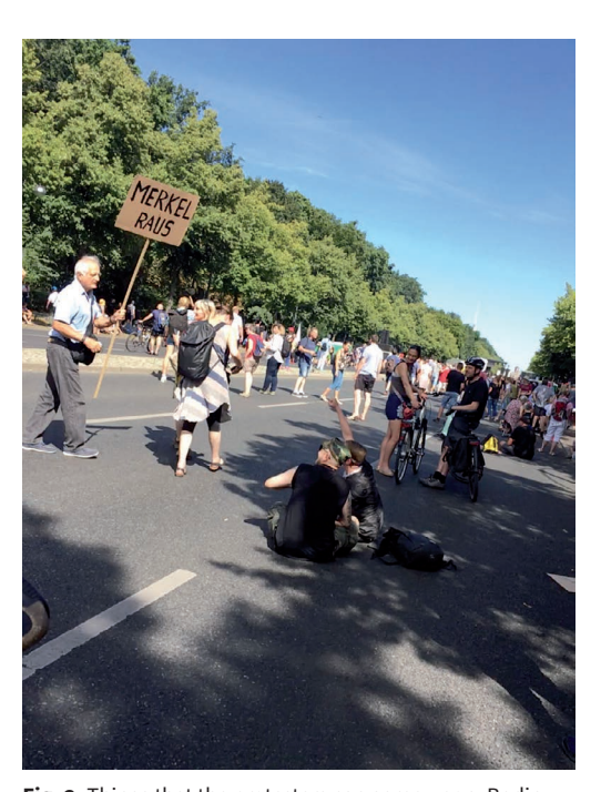
Fig. 3 Things that the protesters can agree upon. Berlin. August 1, 2020.

The T-shirts are often used to express one's own media consumptions. For example, the slogan "Who, if not me?" refers to the latest book critical of Merkel by Henryk M. Broder, who runs the conservative website "Achse des Guten" [Axis of Good]; "Believe little, question everything, think for yourself?" refers to the book by former SPD politician Albrecht Müller, who is co-responsible for the website nachdenkseiten [serious thinking pages]; and "Es kommt immer anders, wenn