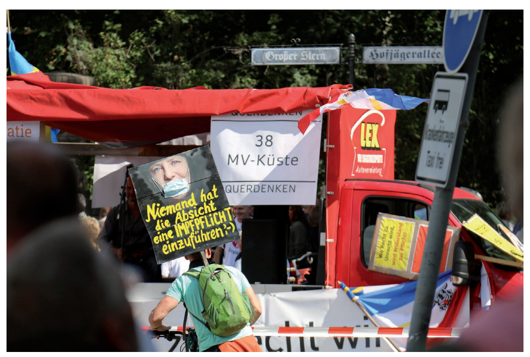
Fig. 9 Prophecy. Berlin. August 29, 2020.