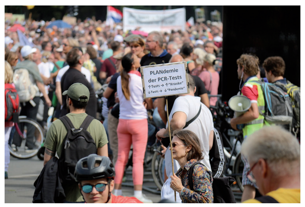
Fig. 7 PCRdemic. Berlin. August 29, 2020.