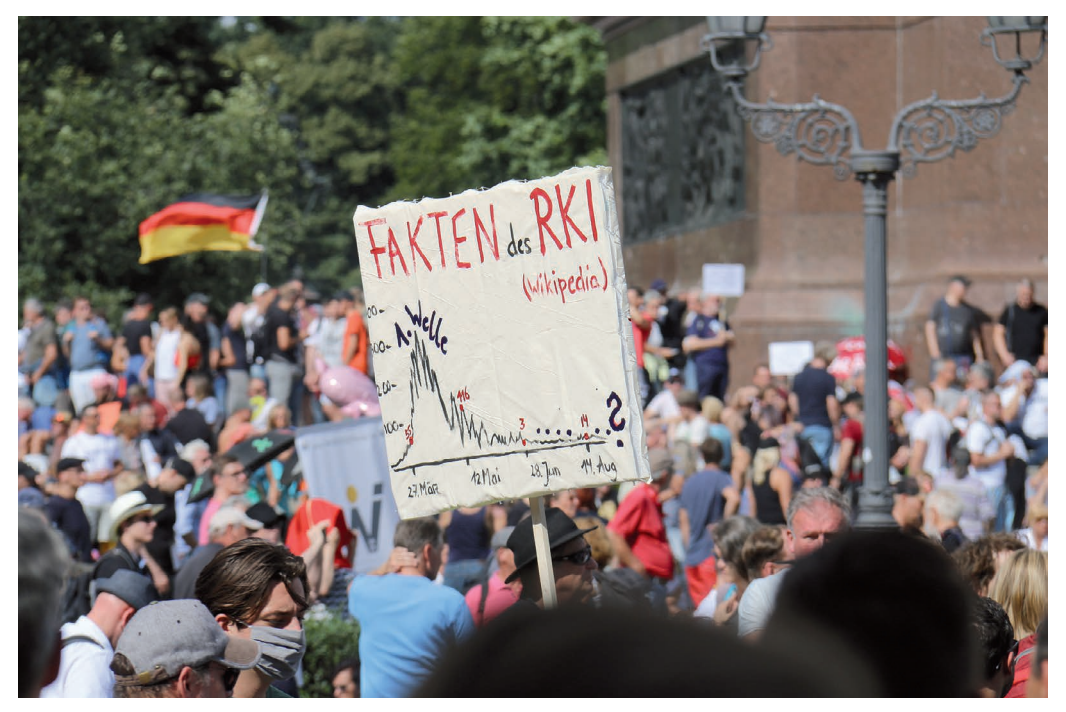
Fig. 11 Fact checkers. Berlin. August 29, 2020.