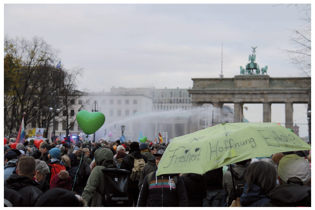
Fig. 26 Freedom, hope, success, and cold water. Berlin. November 18, 2020.