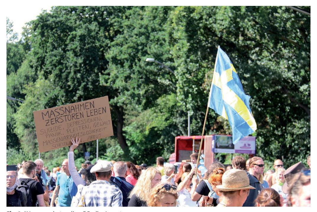
Fig. 8 "Measures destroy lives." Berlin. August 29, 2020.