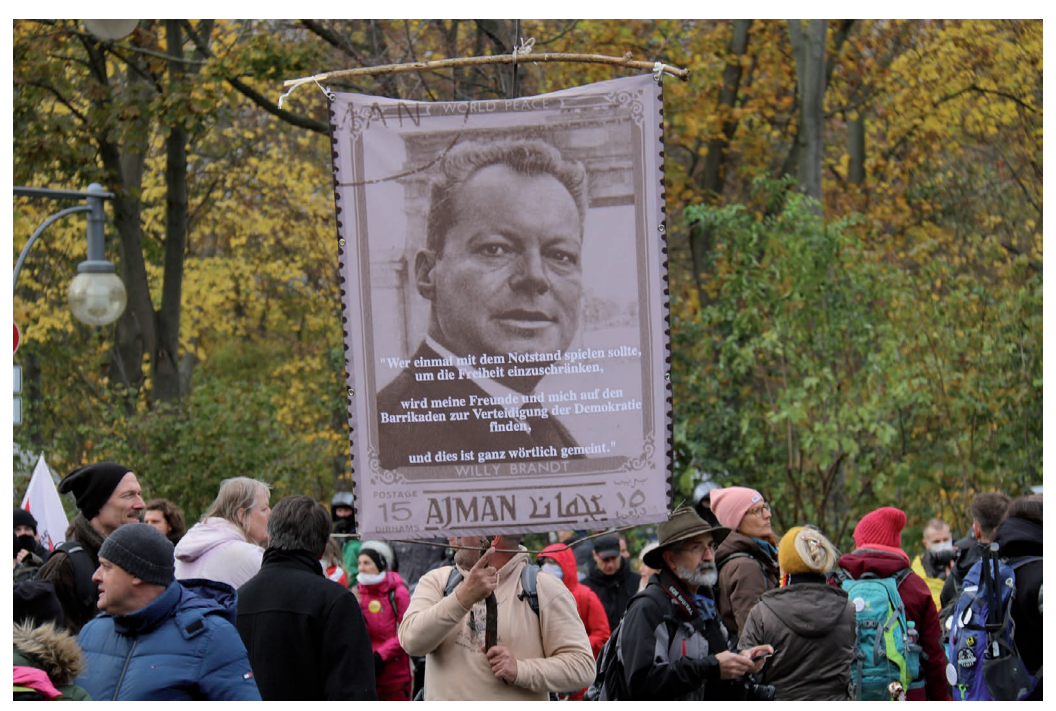
Fig. 24 State of emergency. Berlin. November 18, 2020.