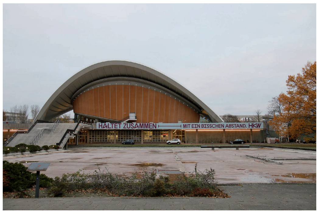
Fig. 30 "Stand together with a little distance." Berlin. November 18, 2020.

from Leipzig?, says one of them delightedly. And referring to the big nationwide demonstration in Leipzig last weekend, he says appreciatively: Leipzig has become a real brand! I guess you know next weekend there will be another demonstration in Leipzig. See you there!