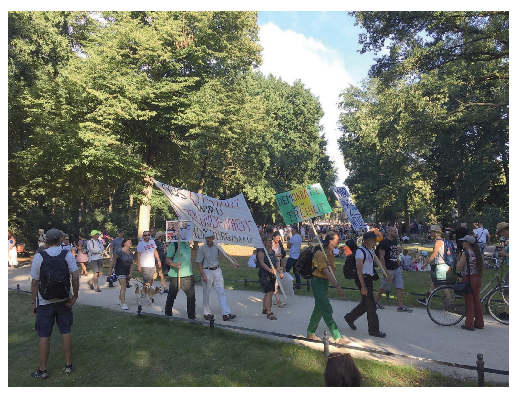
Fig. 1 "We are the second wave!" Berlin. August 1, 2020.