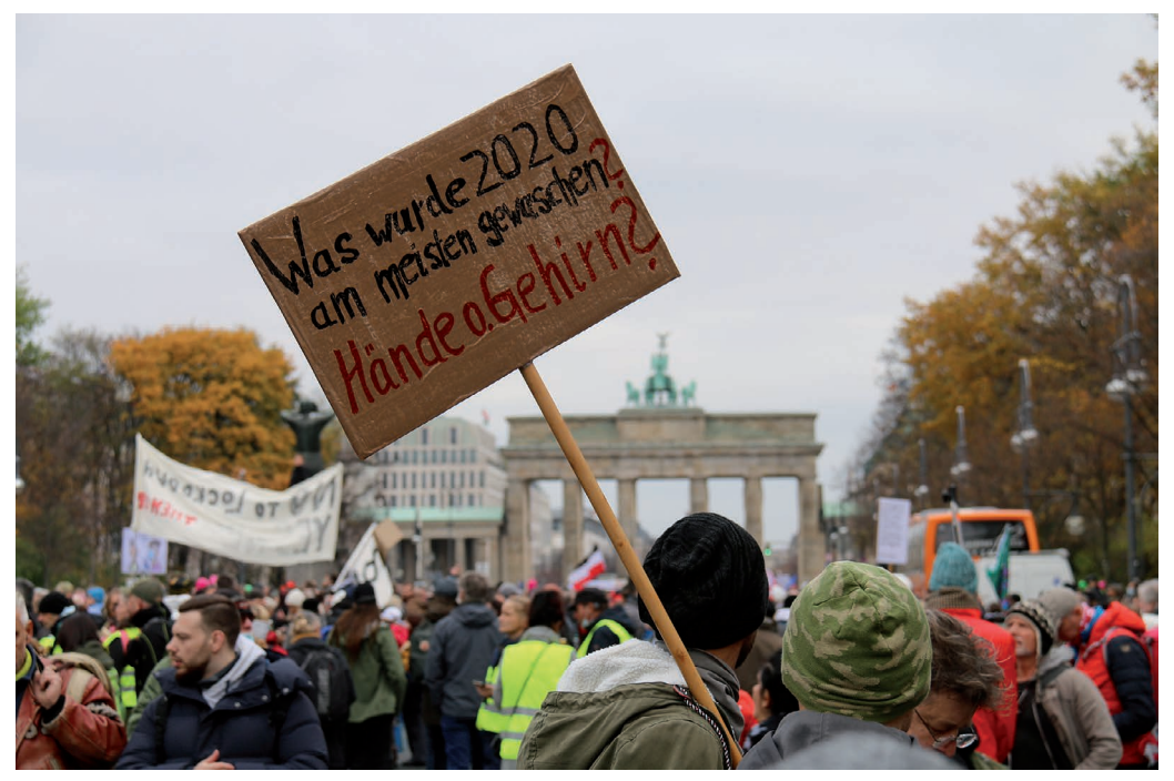
Fig. 22 Washing hands and brains. Berlin. November 18, 2020.