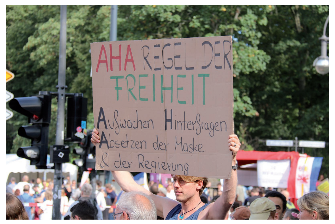
Fig. 12 "Hygiene rules of freedom: Wake up, question, remove mask and government." Berlin. August 29, 2020.

and Belgium among the demonstrators, who carry their national colors and flags.