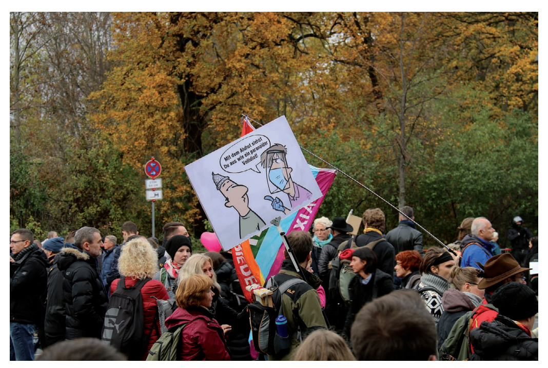
Fig. 28 Paranoia. Berlin. November 2020.

tomorrow. But if so few people continue to stand up, then that's the way it's going to be.