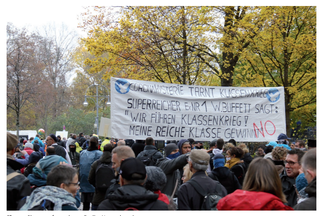
Fig. 27 Class war from above. Berlin. November 18, 2020.