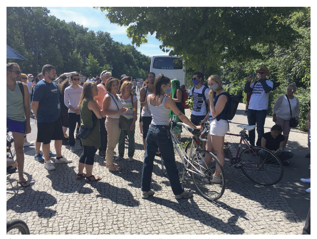
Fig. 2 Demonstrators and counter-demonstrators trying to talk to each other. Berlin. August 1, 2020.

West Berlin in the late 1970s and early 1980s. Many protesters carry homemade cardboard signs with sometimes very long messages in German: