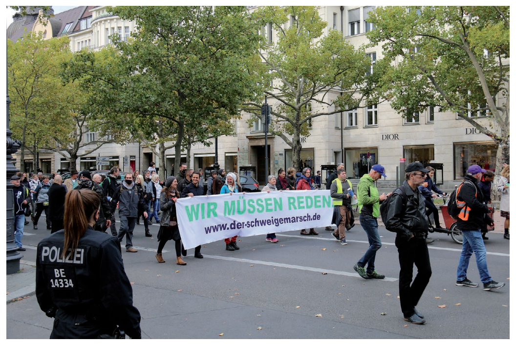
Fig. 17 "We have to talk - the Silent March." Berlin. October 10, 2020.

stration. Even though we're not supposed to bring flags or signs, I saw a homemade cardboard earlier that reads: "We need new conspiracy theories, the old ones have all proven to be true." The children of one woman did not want to accompany her if there was no drumming, another says she left her children at home because she did not know what kind of demonstration it was and how the police would behave. In her environment, people would always complain about the measures and moan that it was getting worse and worse and when she said: "Then come with me on the street!" they waved her off and said, "No, I'm not a demo person."