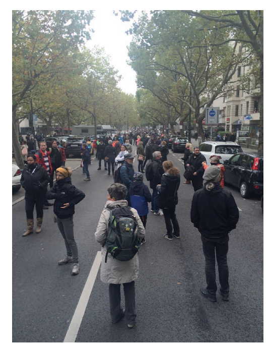
Fig. 16 Waiting until all have one and a half meters distance from each other. Berlin. October 10, 2020.

On October 10, 2020, a "silent march" through Berlin is announced under the slogan "We have to talk!" Starting time is one minute to twelve. In the call, demonstrators are asked to leave flags, signs, banners, as well as clothing with slogans or symbols of organizations, associations, etc. at home. We are a colorful mix of different people who, far from any political orientation, ethnicity, or income, do not agree with the politicization of the Corona virus and the resulting restriction of our human rights, it says on the associated website. What needs to be talked about, among ten other points, above all: that the pandemic of national significance is annulled – without vaccine! The requirements at the demonstration are to wear mouth-and-nose protection and