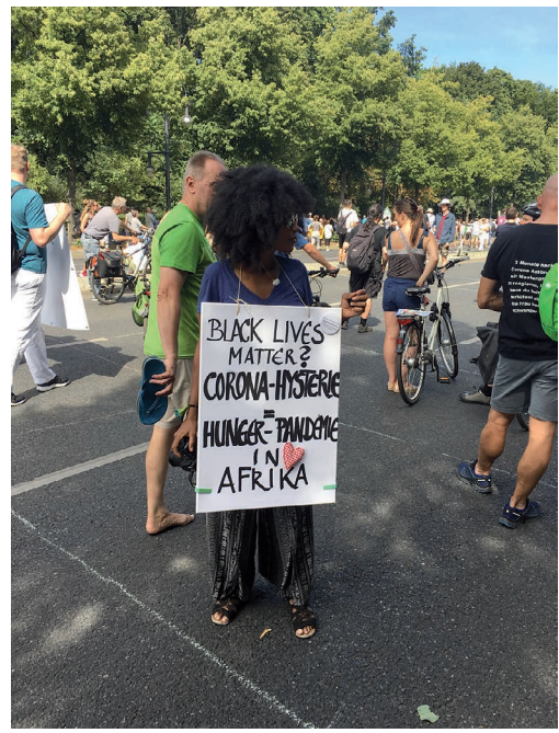
Fig. 4 Hysteria and hunger. Berlin. August 1, 2020.