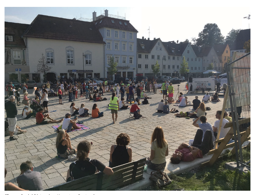
Fig. 15 Social Distancing. Kempten. September 19, 2020.

I get into a conversation with a couple around 50 years old who left their daughter at home the first nine days when at school masks were compulsory. At Lake Constance, there is a café where you don't have to wear a mask, sometimes they go there for about an hour to drink coffee, out of solidarity. The woman works in a health food store. At the beginning, my boss was extremely afraid of the virus, so everyone had to wear masks. Now, when it turned out that everything was not as dramatic as