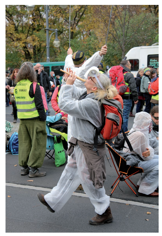
Fig. 21 Better safe than sorry. Berlin. November 18, 2020.

As it gets dark, about 200 people gather in front of Bellevue Palace, the seat of the German president. Most of them stand around in small groups. I hear someone complaining about the many German flags among the demonstrators. Well, he is answered, I can understand that. You can see where internationalism has led. The German flag stands for everything that the globalists want to take away from