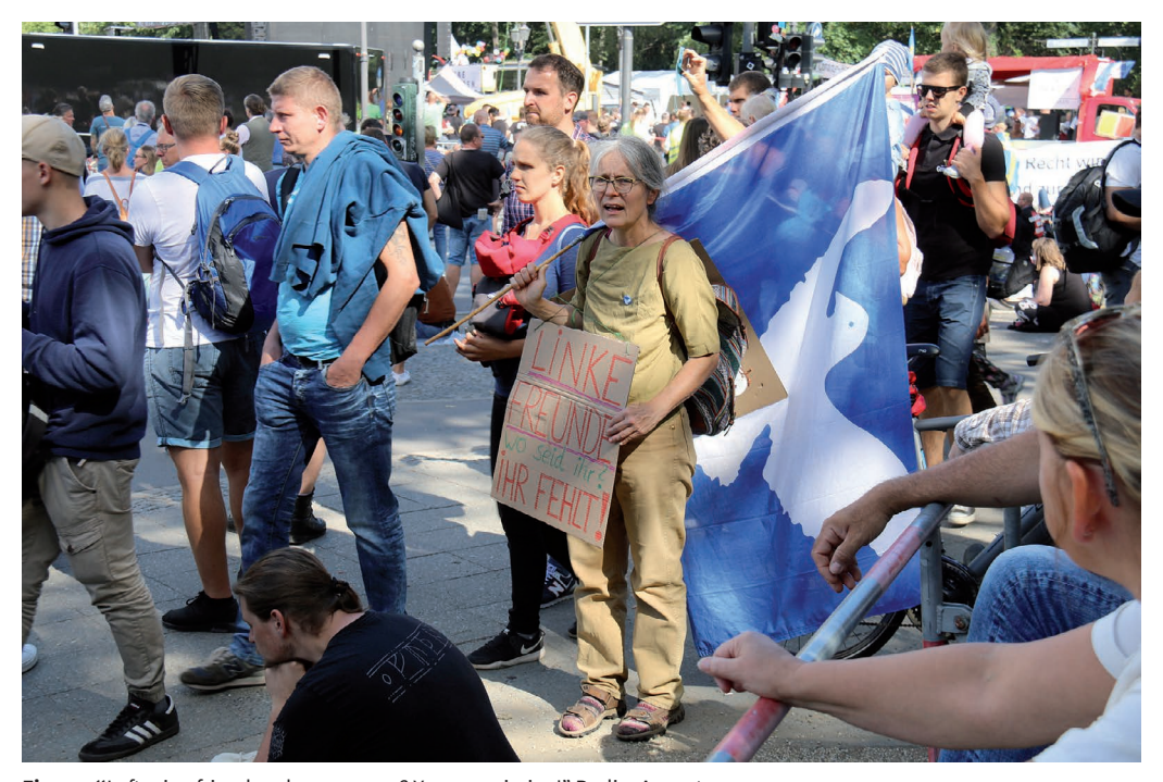
Fig. 10 "Left-wing friends, where are you? You are missing!" Berlin. August 29, 2020.