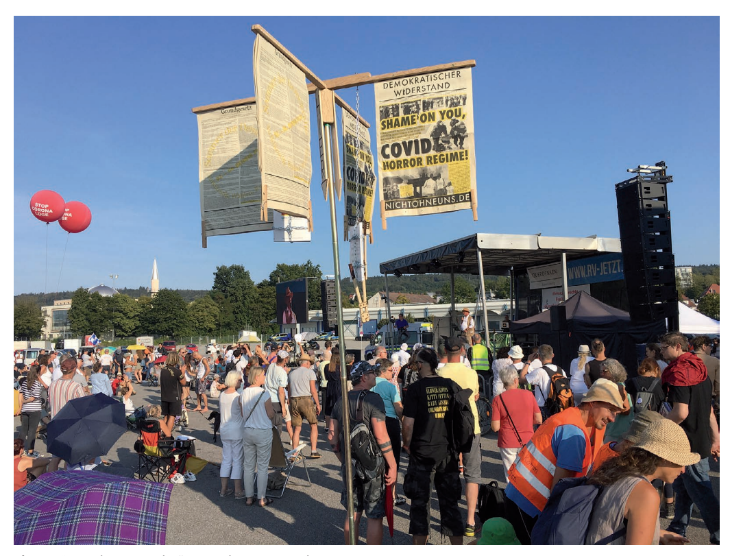
Fig. 14 "Stop the Corona lie." Ravensburg. September 13, 2020.

truck that leads the march. Next to the drummers on the truck, a woman stands and shouts to the crowd, Why are you here? And the crowd shouts in rhythm with the drums, We are here, we are loud, because we are being robbed of our freedom. At the side, a young man wearing a face mask stands and gives a thumbs-down to the demonstrators. A little further, a man in his 40s stands at the sidelines and aggressively shouts to the crowd that they are Nazis and fascists. A woman wearing a cloth mask takes a selfie with the demonstration in the background. When a demonstrator wants to give her a flyer, she gesticulates wildly in defense and quickly moves away. A demonstrator with a guitar sings in a good mood: