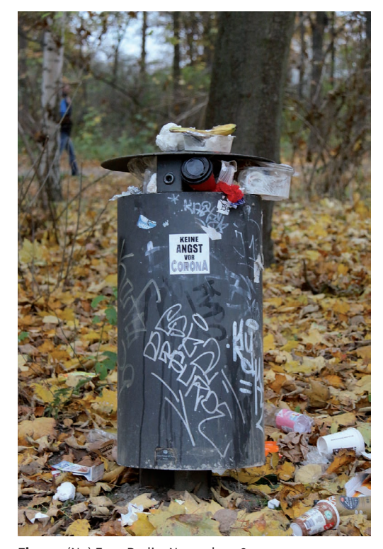
Fig. 29 (No) Fear. Berlin. November 18, 2020.

let themselves be harnessed to the elites. They make themselves useful idiots. Instead of fighting against the rich, they fight against those who fight against the rich. And then they accuse the demonstrators of being Nazis and anti-Semites who trivialize National Socialism and the Holocaust. I would rather say it's trivializing Nazism and the Holocaust to call the protesters Nazis. I mean, do they know what Nazis are? And then again and again this mantra, 'If just one human life is saved by the measures, then it was all worth it.' But, I mean, how many people die because of the measures? They all just have their own little world in mind and think that solidarity consists mainly of going shopping for their neighbors. How great we are to take care of our dear fellow human beings. I have to vomit. They have no idea at all about politics, about economics and global relations and about geo-strategic considerations. Most of the supporters of the measures I have met have no clue at all. And even in politics: the other day I talked to a young politician of the Green Party from my constituency. He had never heard of the Great Reset before.