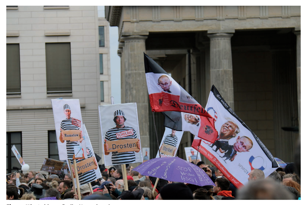
Fig. 25 Who to blame. Berlin. November 18, 2020.