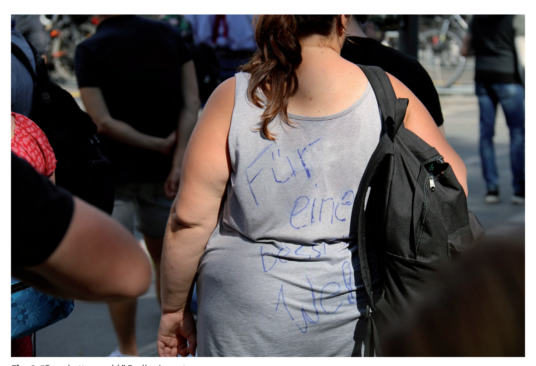
Fig. 6 "For a better world." Berlin. August 29, 2020.

"Stop the neo-Nazis. Never again dictatorship", "Plandemic of PCR tests. Tests up = sick people up / Tests down = pandemic down",