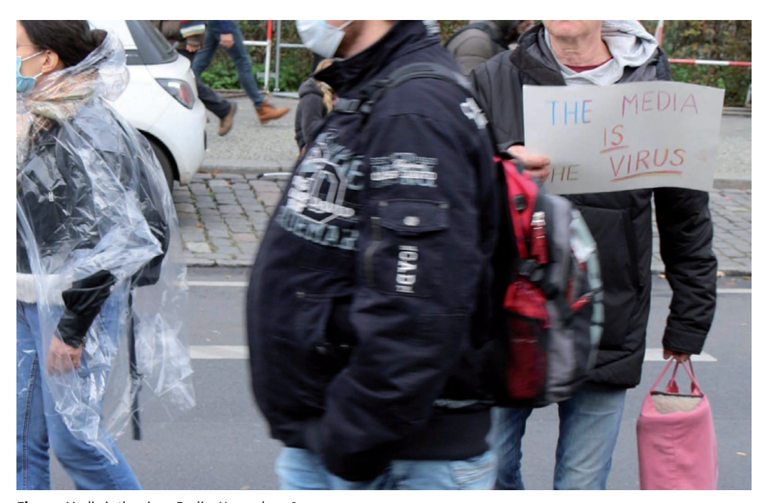
Fig. 23 Media is the virus. Berlin. November 18, 2020.