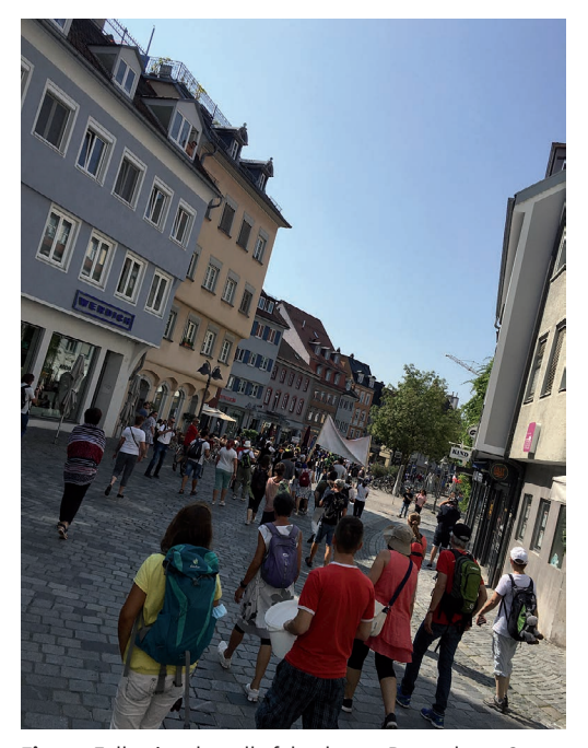
Fig. 13 Following the call of the drums. Ravensburg. September 13, 2020.

Before the protest march starts, flyers, flowers, and copies of the Basic Law are handed out. Many participants have brought drums or plastic buckets and begin to beat in unison. We follow the