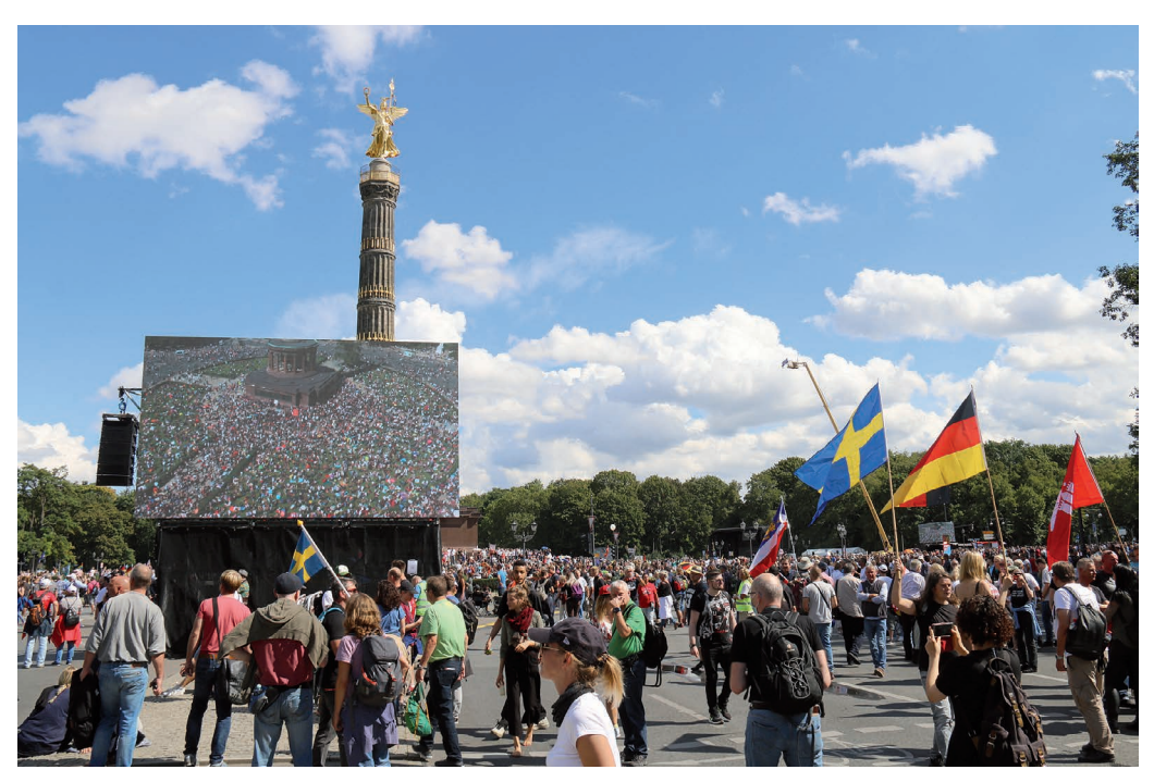
Fig. 5 Germany, Sweden and the Siegessäule. Berlin. August 29, 2020.

the curve" to avoid overloading the health care system; when in the end there was no shortage of beds, it was suddenly about the reproduction factor; and now the reproduction factor is fine and the measures continue anyway. And in the news, you always hear only bad news, there is no glimmer of hope at all, especially for entrepreneurs. There simply seems to be no plan as to what exactly the goal of the measures is. The woman is a physiotherapist and says for her it is about a different approach to health, there are so many things in nature that have healing powers; unfortunately, the relevant knowledge is increasingly lost or pushed into the background.